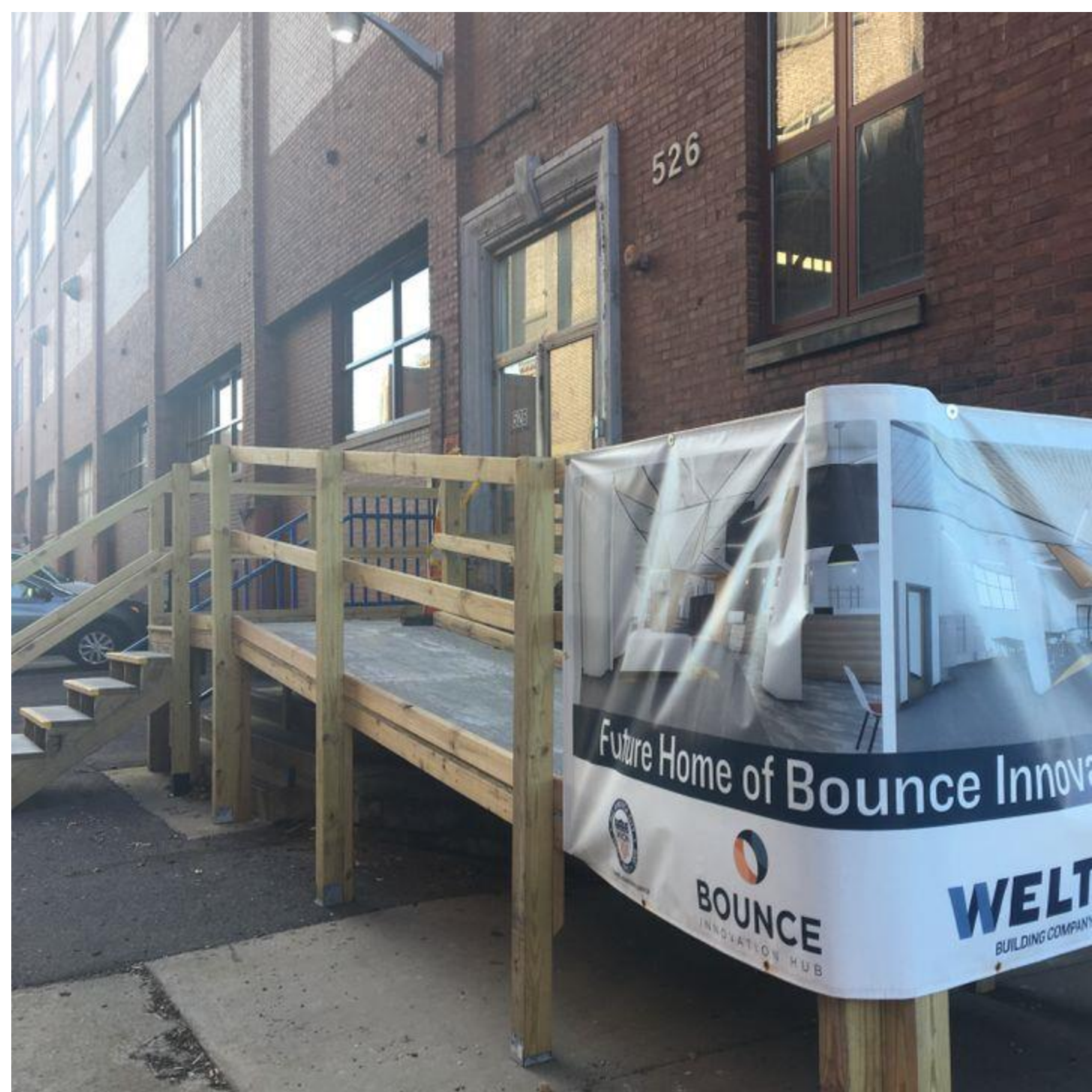
12 / 12