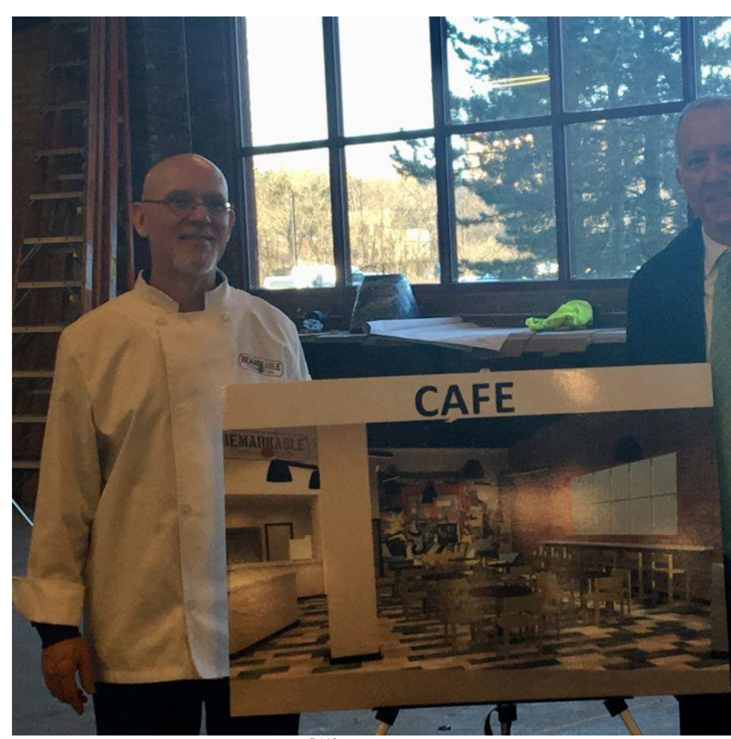
7 / 12

Bounce Innovation Hub reveals design for new 'Generator' entrepreneurial space