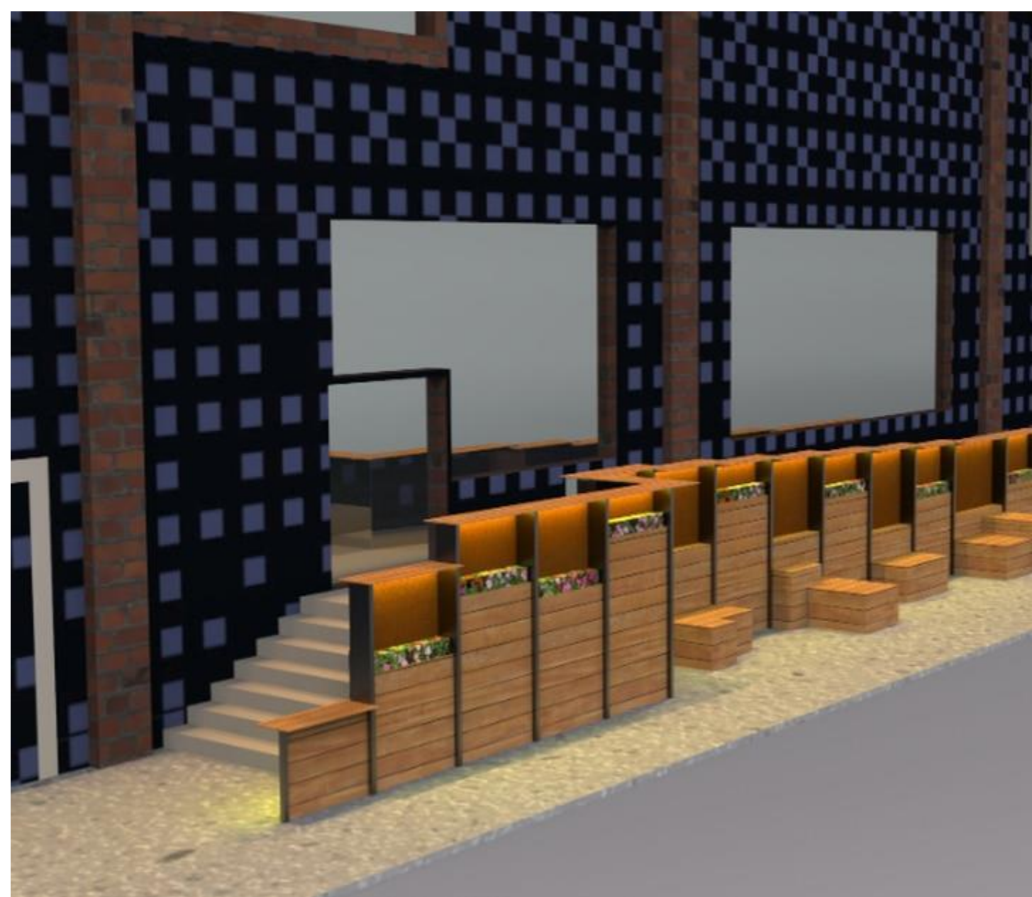
9 / 12