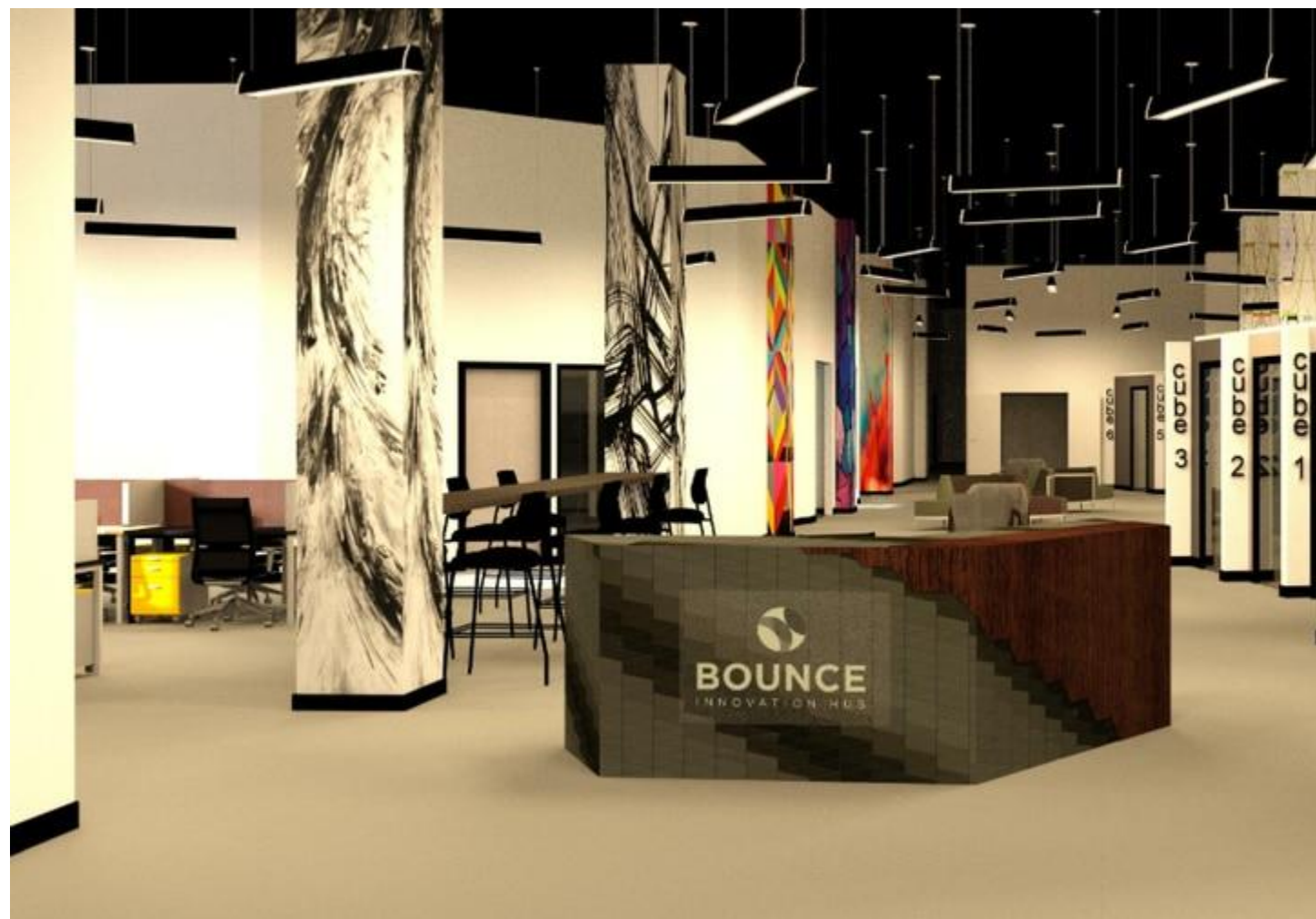
5 / 12

Bounce Innovation Hub reveals design for new 'Generator' entrepreneurial space