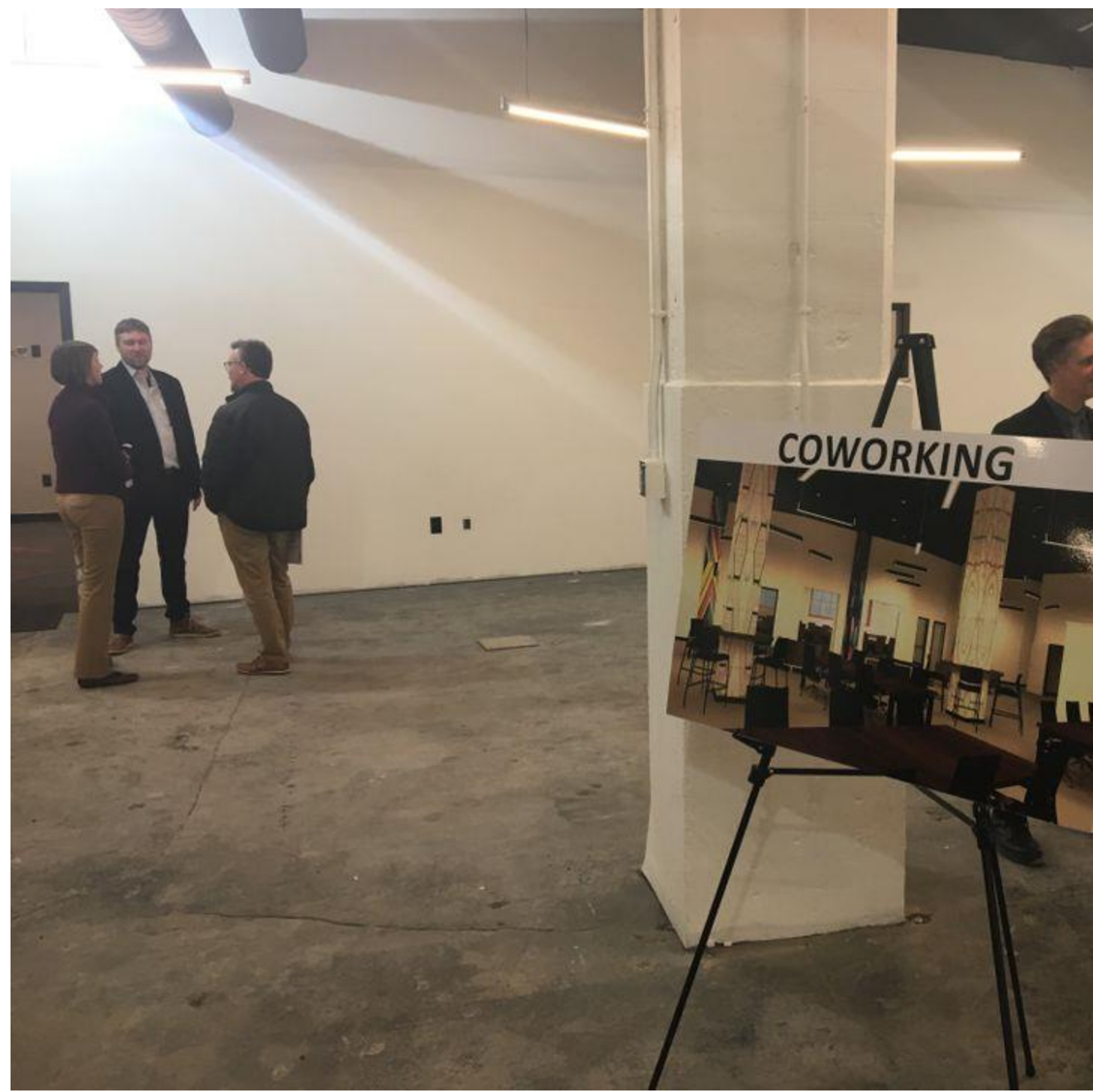
10 / 12