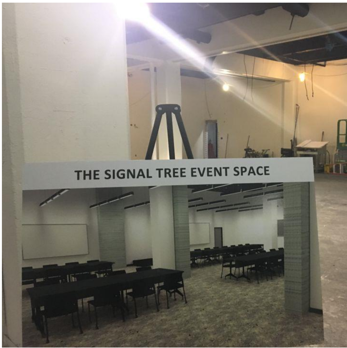
2 / 12