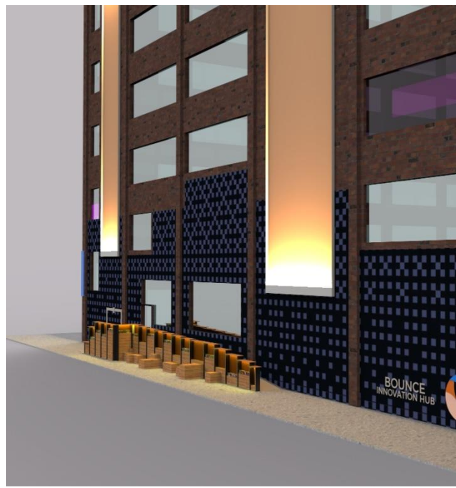
8 / 12