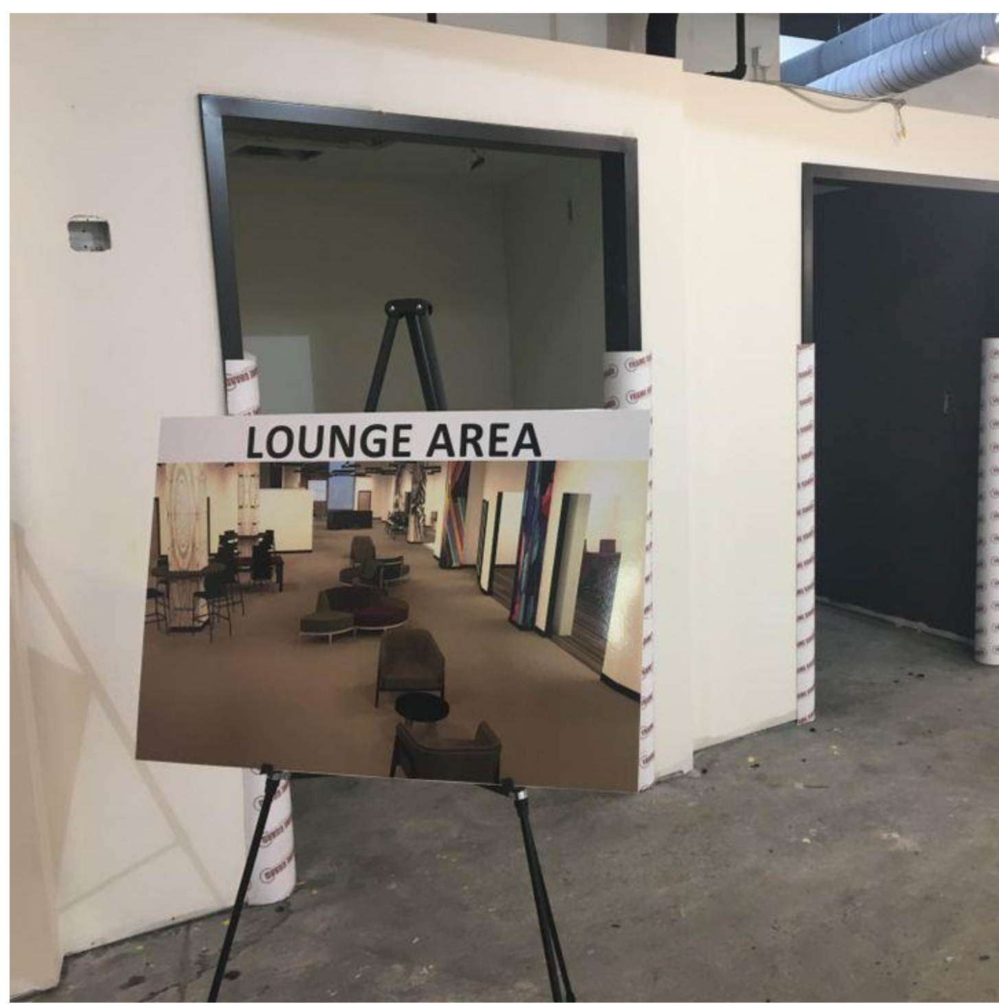
4 / 12