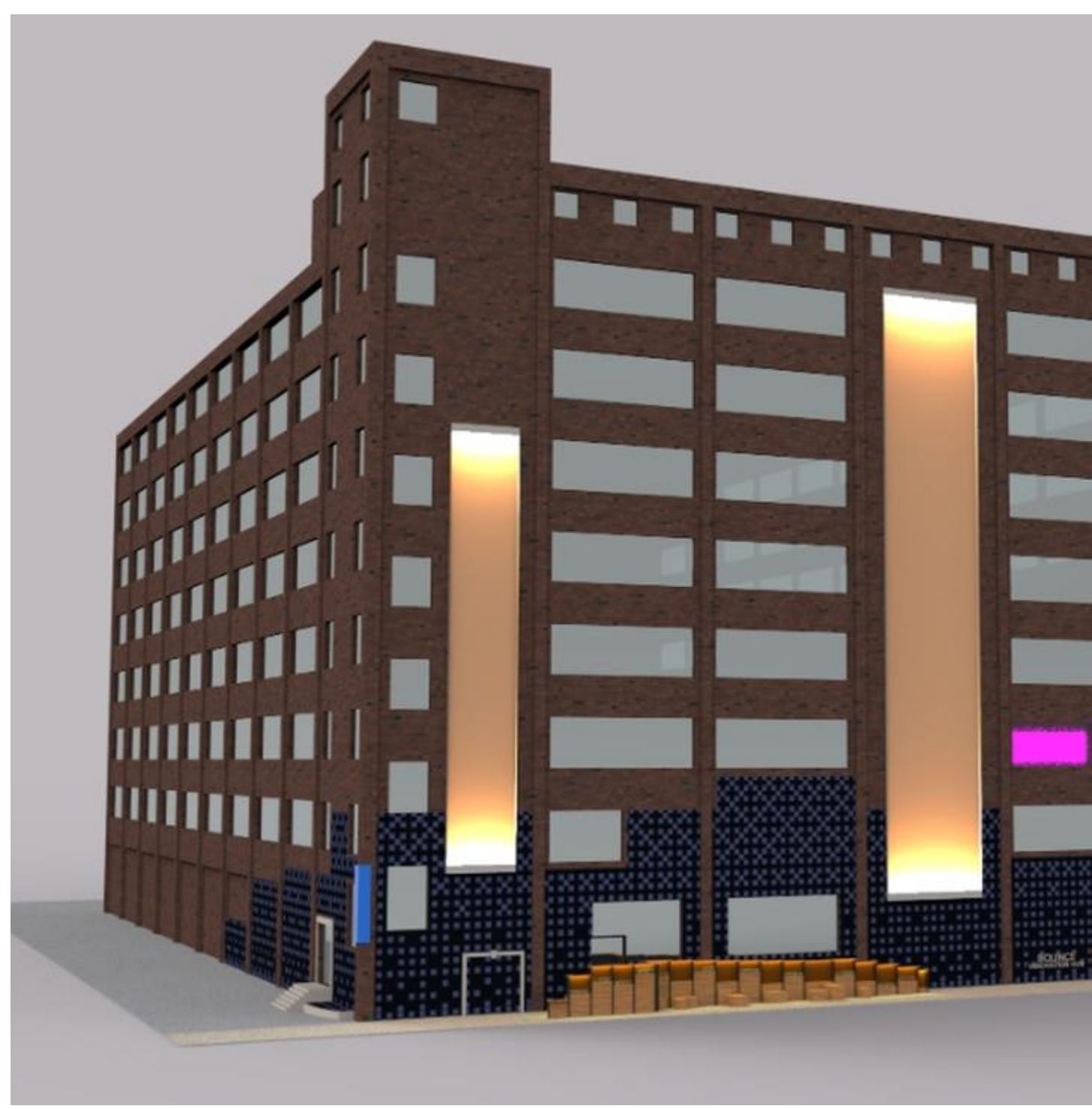
1 / 12