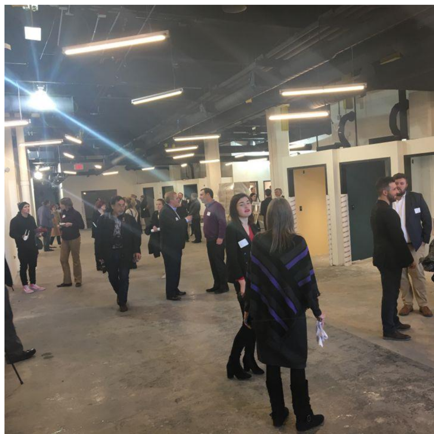
3 / 12